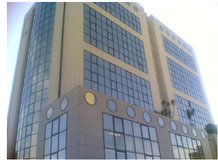
CMS Office building at the center of Lisbon

Caixa Mágica Software is a company specialized in open-source solutions. Having a wide range of products and services developed internally since 2000, it aims to create added value for each client. According to GFK market report, Caixa Mágica is leader in portuguese Linux market in the retail channel.